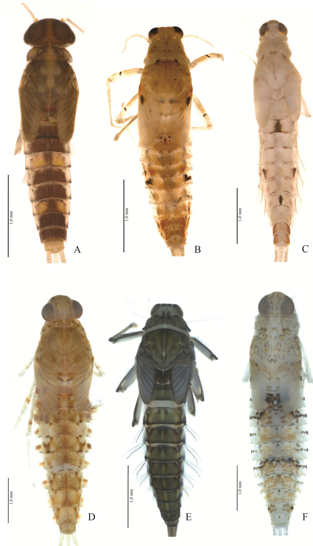
Figure 2. Baetidae nymphs, dorsal view. A. Americabaetis alphas ; B. Apobaetis fiuzai ; C. Apobaetis sp. nov. A; D. Callibaetis sp. A; E. Camelobaetidius janae ; F. Cloeodes auwe .