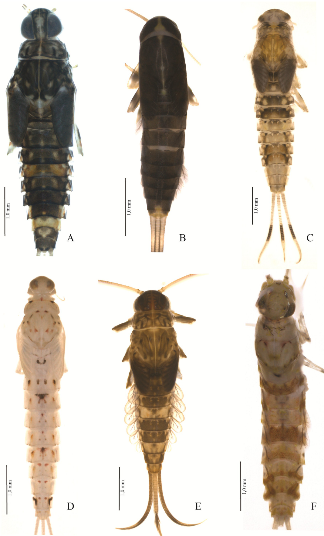
Figure 3. Baetidae nymphs, dorsal view. A. Cloeodes sp. nov. A; B. Guajirolus rondoni ; C. Harpagobaetis gulosus ; D. Rivudiva trichobasis ; E. Spiritiops silvudus ; F. Waltzoyphius roberti .